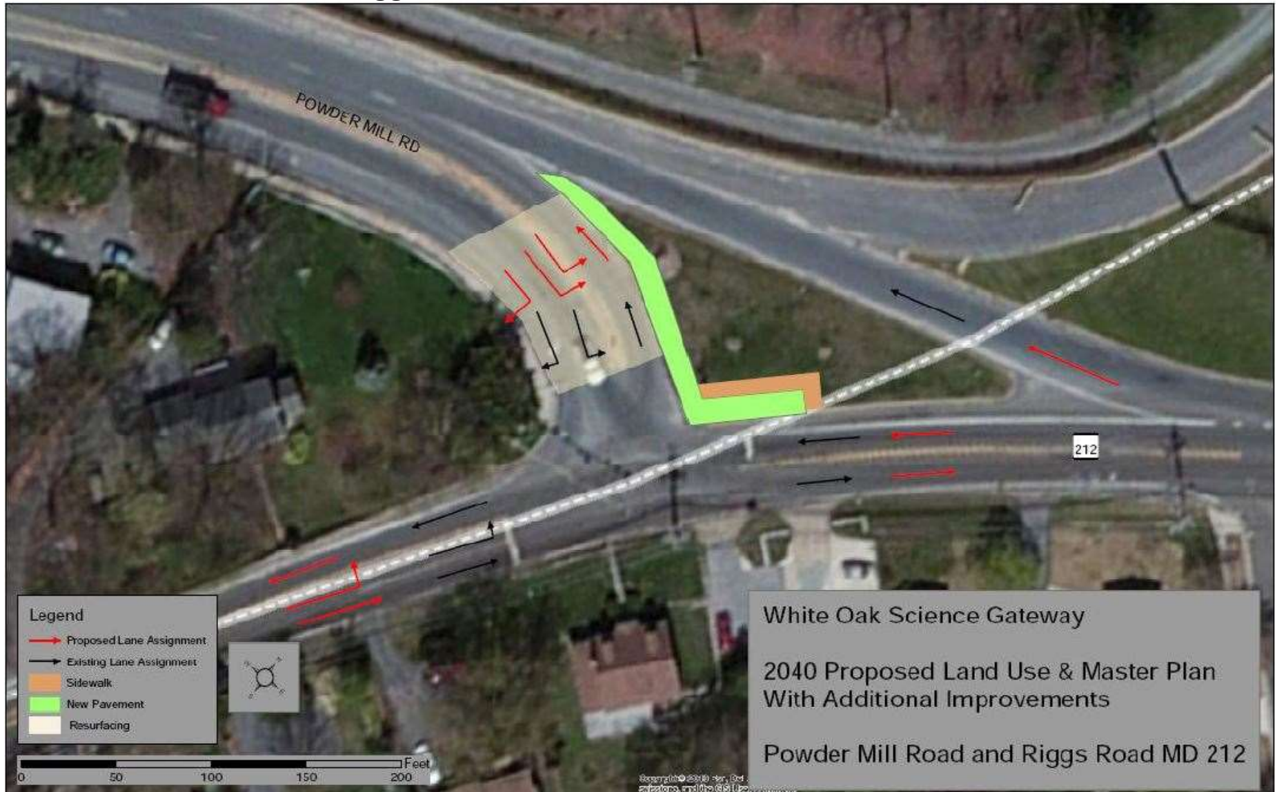
Figure 43 Alternative Master Plan with Supplemental Intersection Improvement Powder Mill Road and Riggs Road